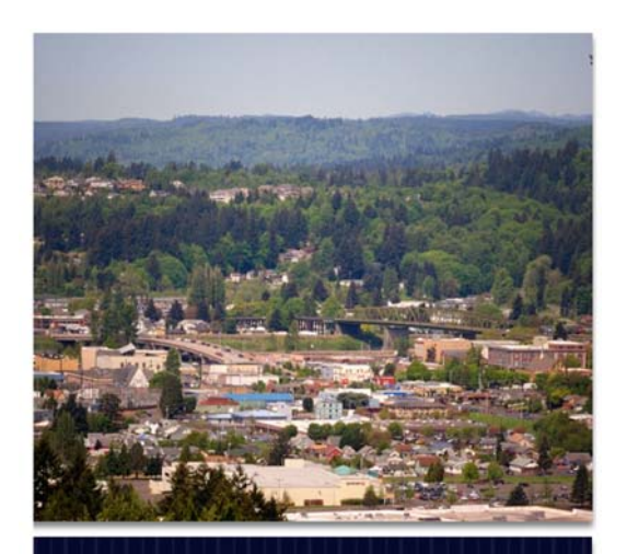
The City of Kelso is a quaint little community in the heart of Cowliz County Washington.