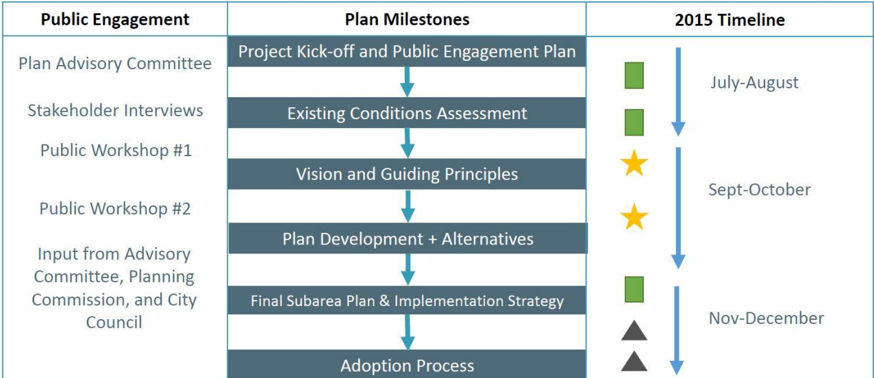
Figure 2. Project Schedule + Milestones